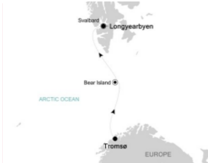
Fares shown are per guest and subject to changes

With a team of dedicated experts on hand, this 10-day expedition is a phenomenal experience. As you cruise around Svalbard and visit the eastern and least visited Spitsbergen, search for Polar Bear, Arctic fox and Bearded seal. Wrap up warmly for a trek across the tundra to observe diverse seabirds, rare wildflowers and incredible geological sites..