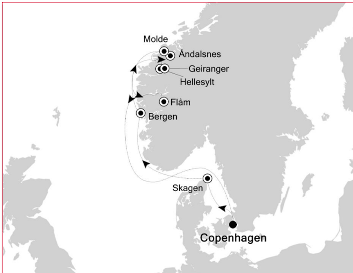
Fares shown are per guest and subject to changes

Navigate the steep inclines, and gaping drops, of Norway's magnificent fjords, on a journey of glass-smooth waters, and breathtaking views. Rainbow coloured warehouses reflect in the waters of pretty ports, and stacks of jagged mountains prick the sky at achingly beautiful cities like Bergen and Molde. The wide horseshoe bend of Geiranger's fjord is natural poetry at its finest.